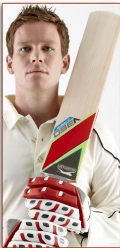
BATS & BALLS